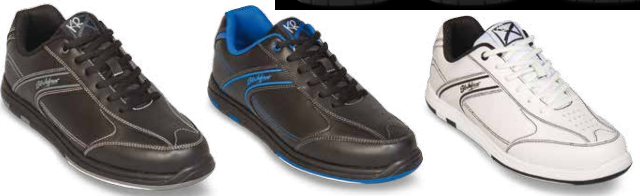
Black available in wide width